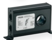
Steca PA HS200 Shunt (page 50)